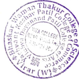
Convener Exam Committee